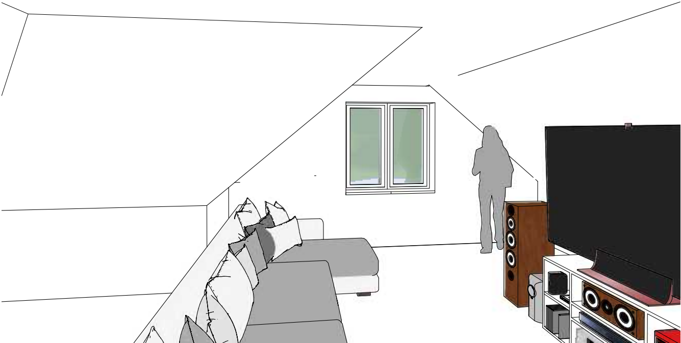
View to home cinema window.