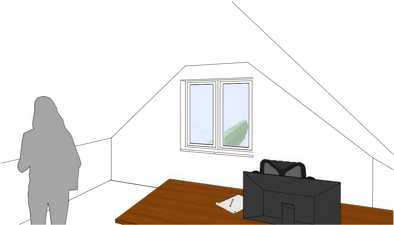
View to office window.