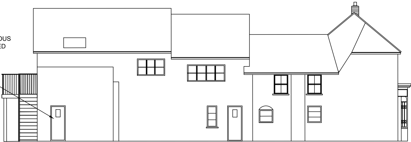
PROPOSED SIDE EXTENSIONS

NEW EXTENSION WALLS AND ROOF TO MATCH THE APPEARANCE AND MATERIALS OF EXISTING HOST BUILDING IN LINE WITH GRADE 2 LISTED BUILDING REQUIREMENTS