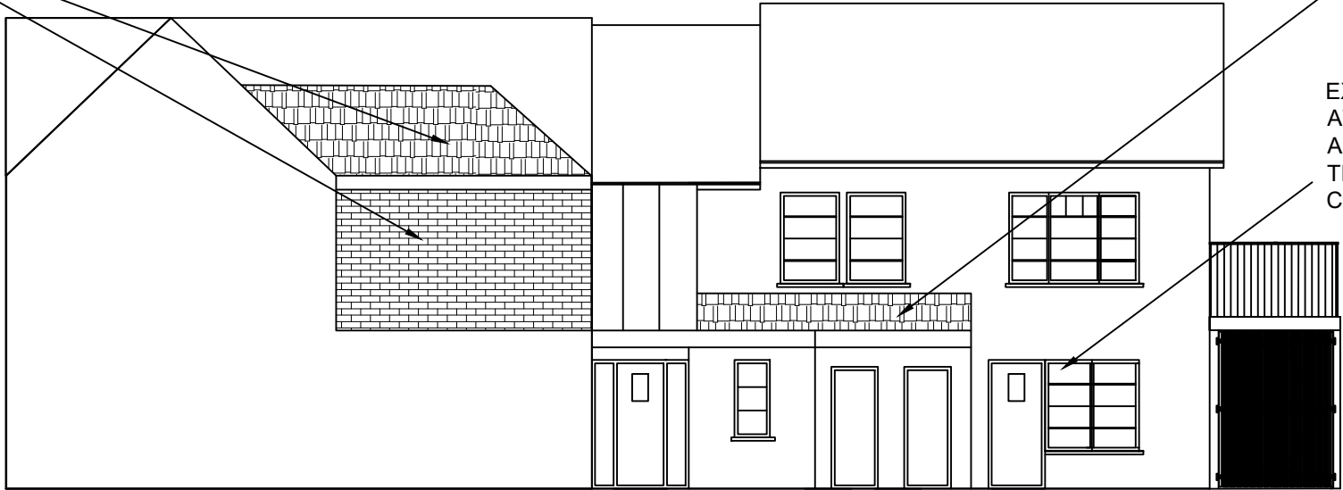
PROPOSED SIDE EXTENSIONS

NEW EXTENSION WALLS AND ROOF TO MATCH THE APPEARANCE AND MATERIALS OF EXISTING HOST BUILDING IN LINE WITH GRADE 2 LISTED BUILDING REQUIREMENTS