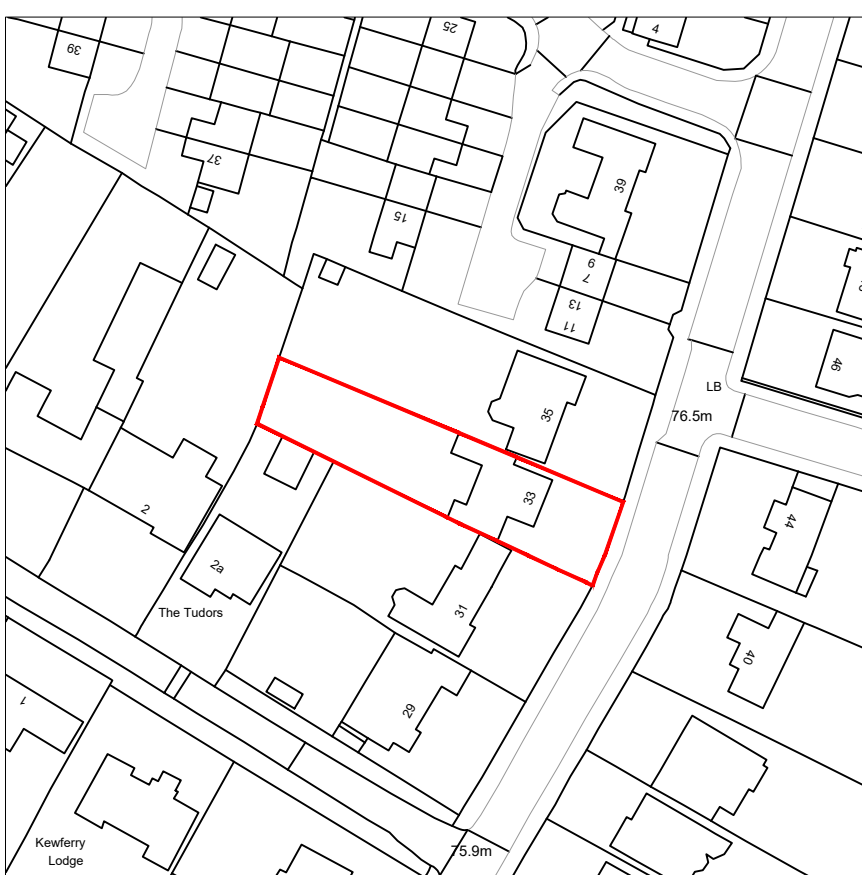
SITE PLAN (1:1250)