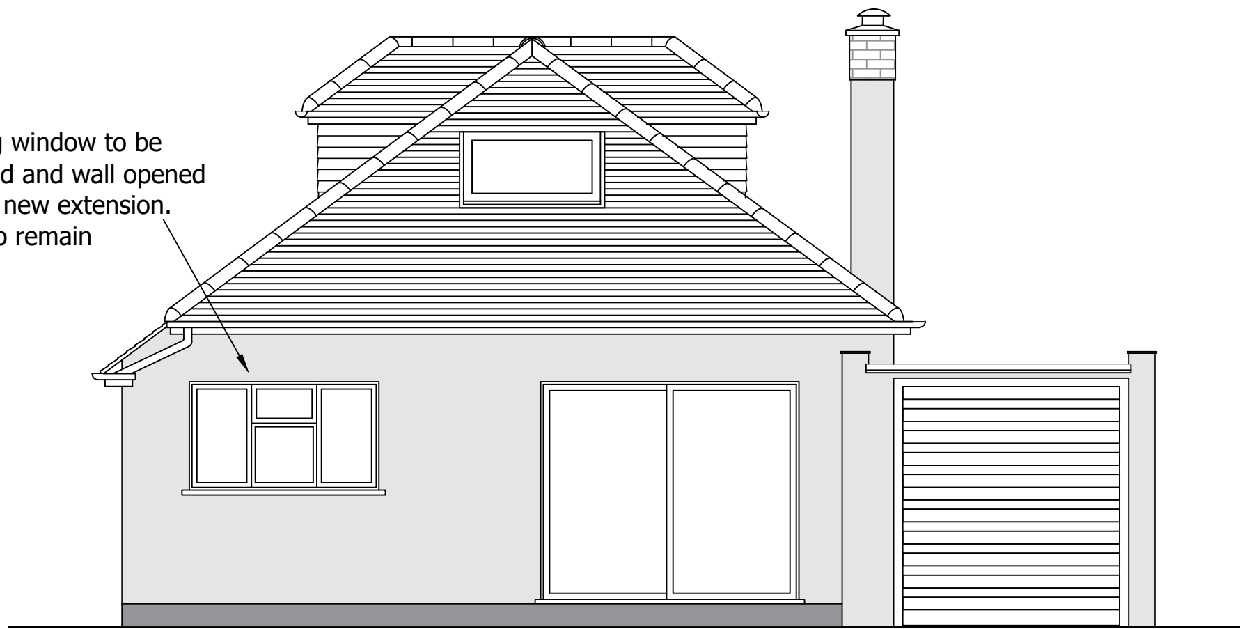
EXISTING REAR ELEVATION 1:50 @ A1

Existing window to be removed and wall opened up into new extension. Lintel to remain