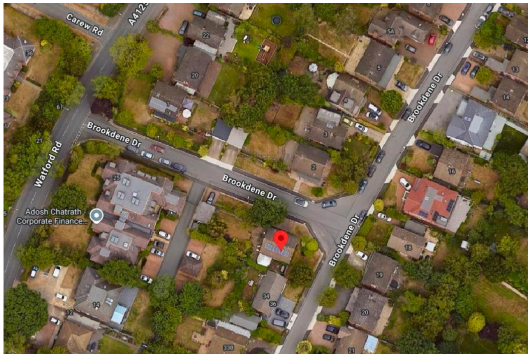
Figure 1 – Google maps showing site location