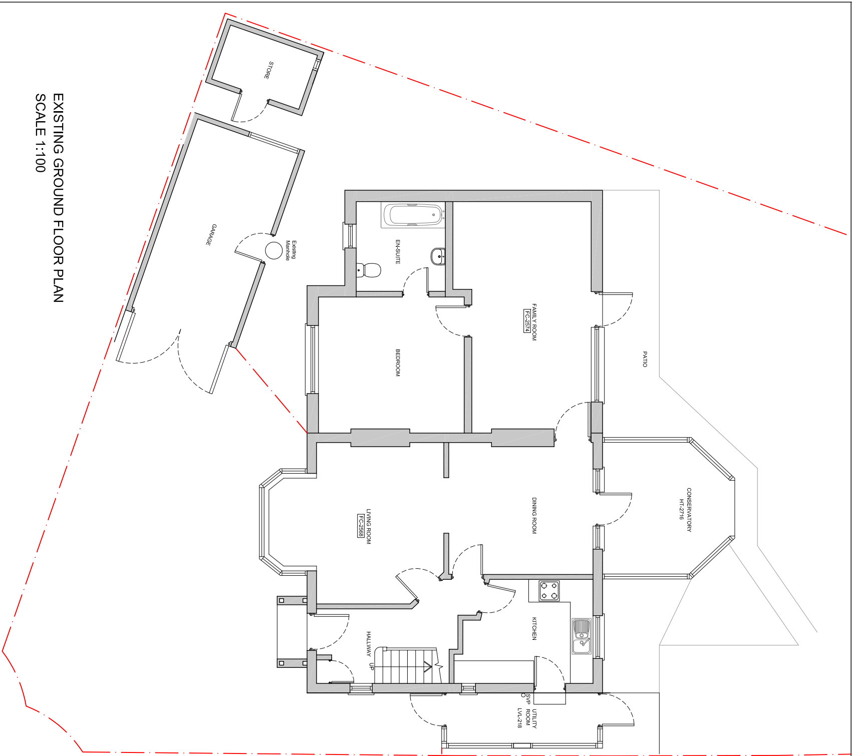
EXISTING GROUND FLOOR PLAN SCALE 1:100