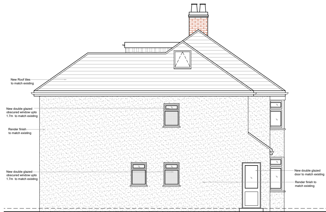
03 - LEFT SIDE ELEVATION