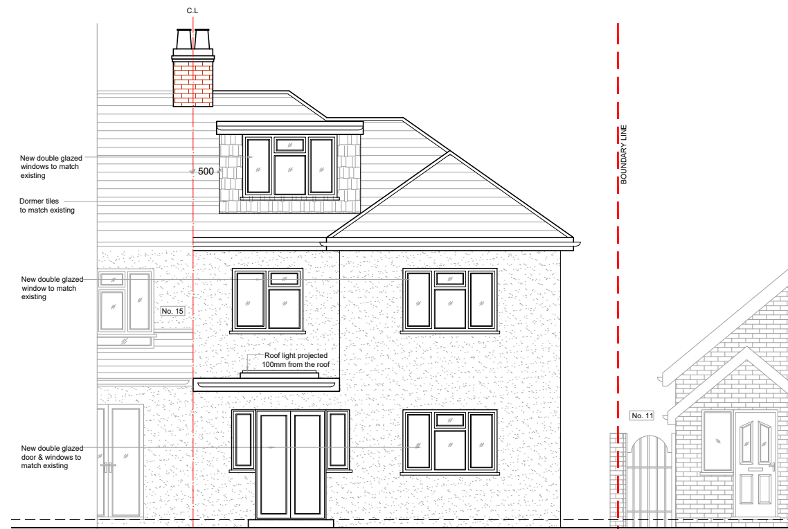
02 - REAR ELEVATION