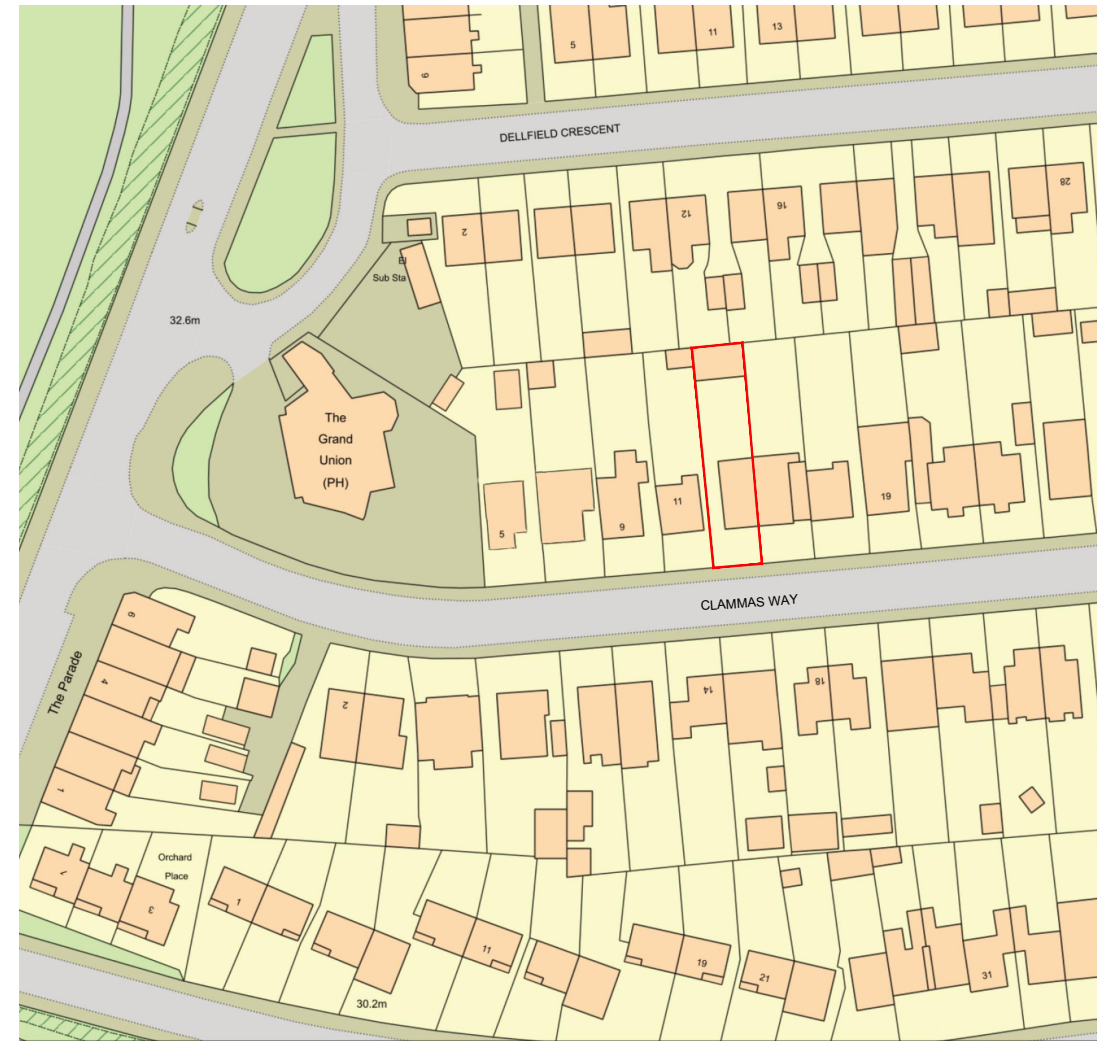
02 - OS MAP SCALE 1:1250