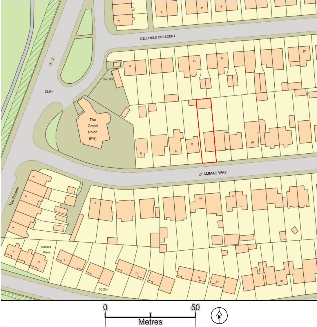
02 - OS MAP SCALE 1:1250