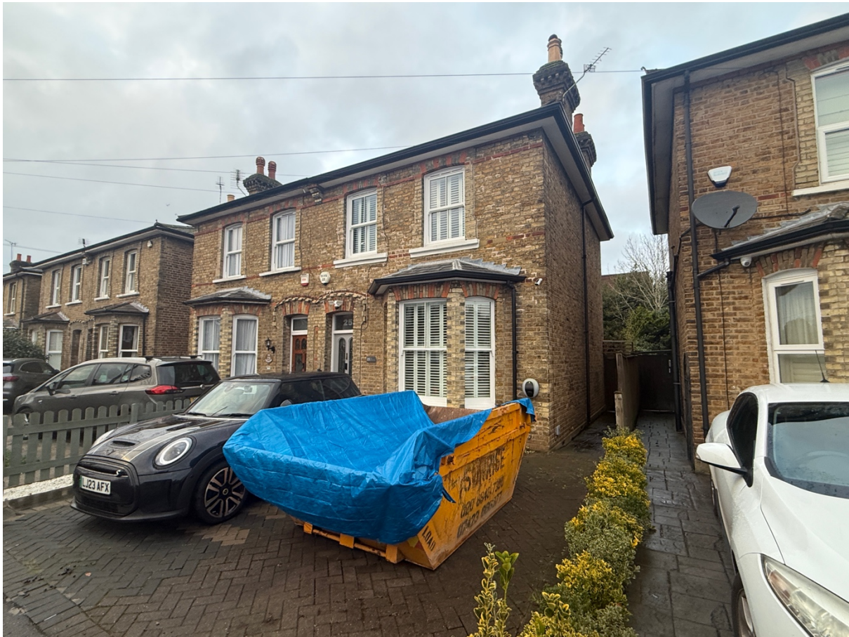
Photograph of the front elevation of 25 The Greenway.