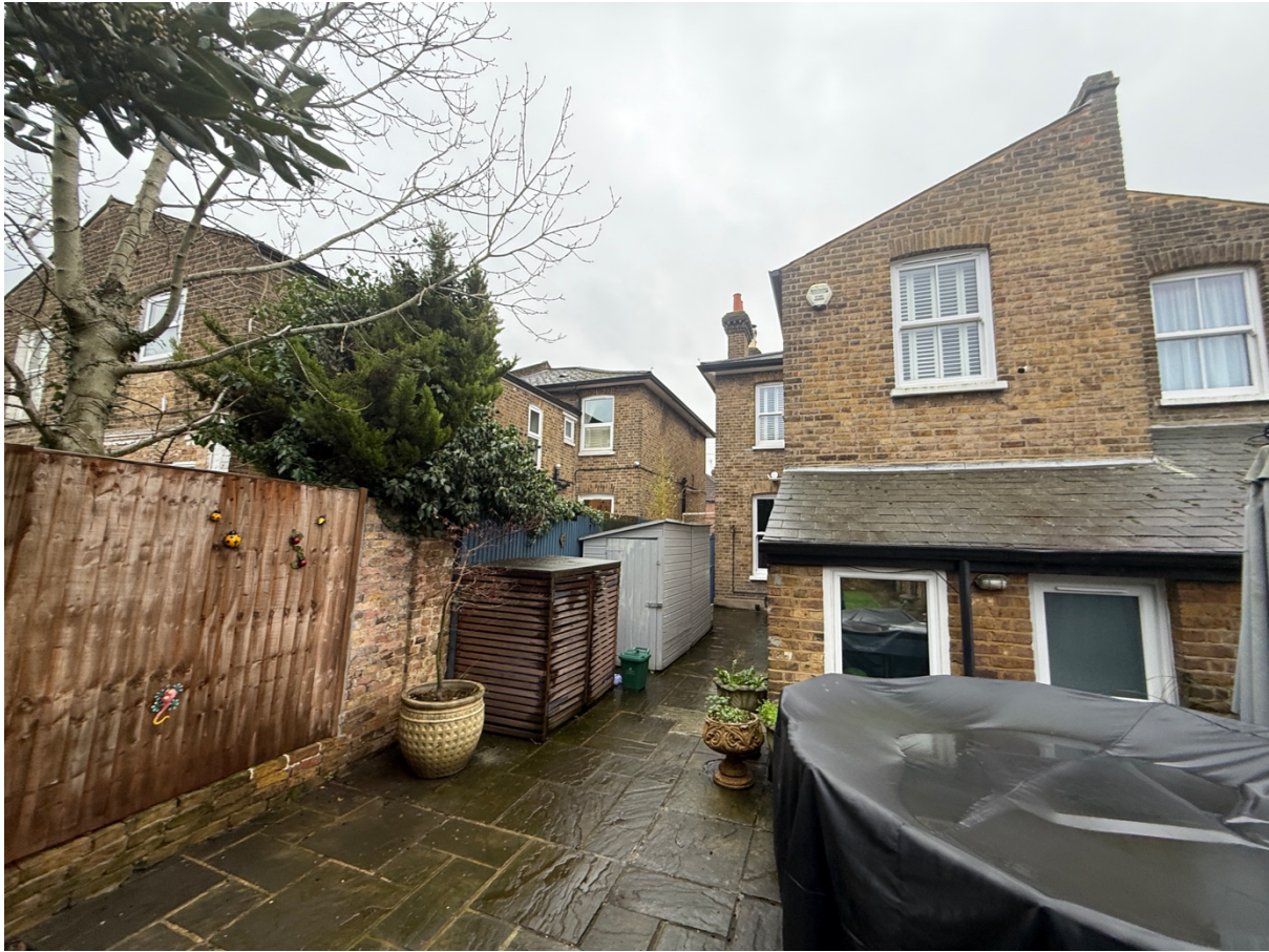
Photograph of the rear elevation of 25 The Greenway