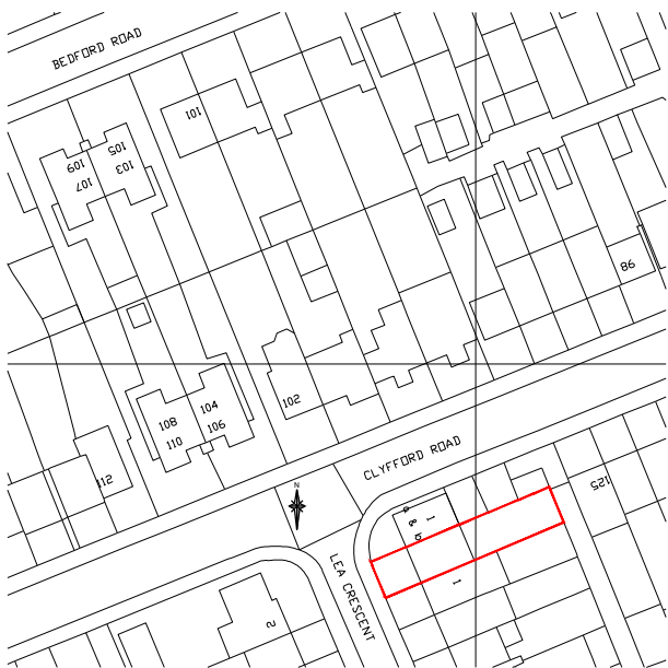
LOCATION PLAN 1/1250

Notes Do not scale, use figured dimensions only. All dimensions to be verified on site prior to the commencement of any work or the production of any shop drawing. All discrepancies to be reported to the Architect. This drawing is to be read in conjunction with all related Architects and Engineers drawings and any other relevant information including the designer(s) residual hazard schedule and other pre-construction information before commencement of any works on site.