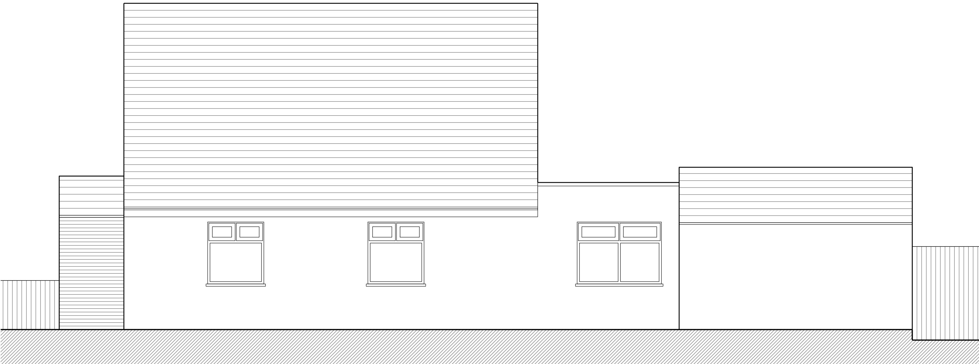
Proposed Side elevation 02 400