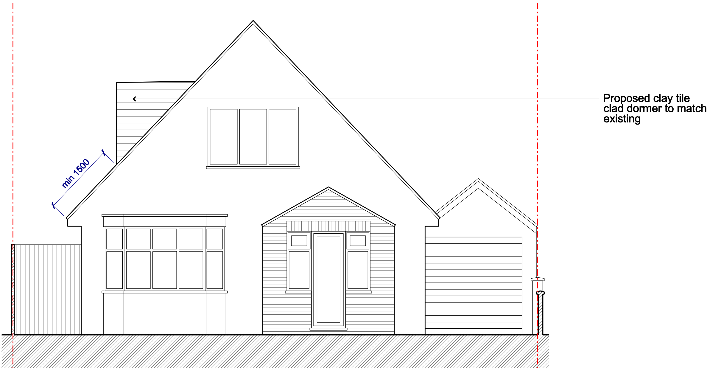
Proposed Front elevation 01 400