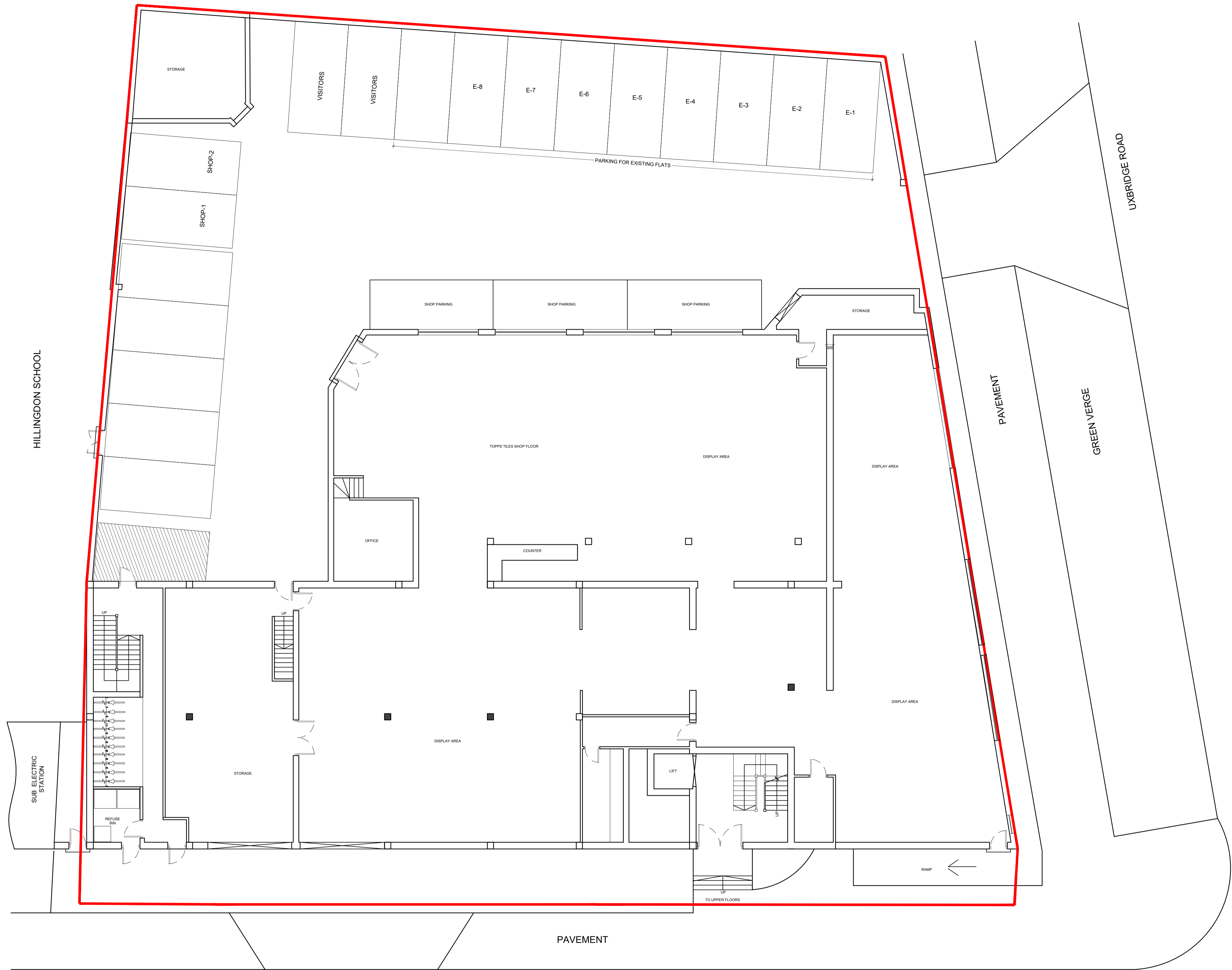
01 - GROUND FLOOR PLAN