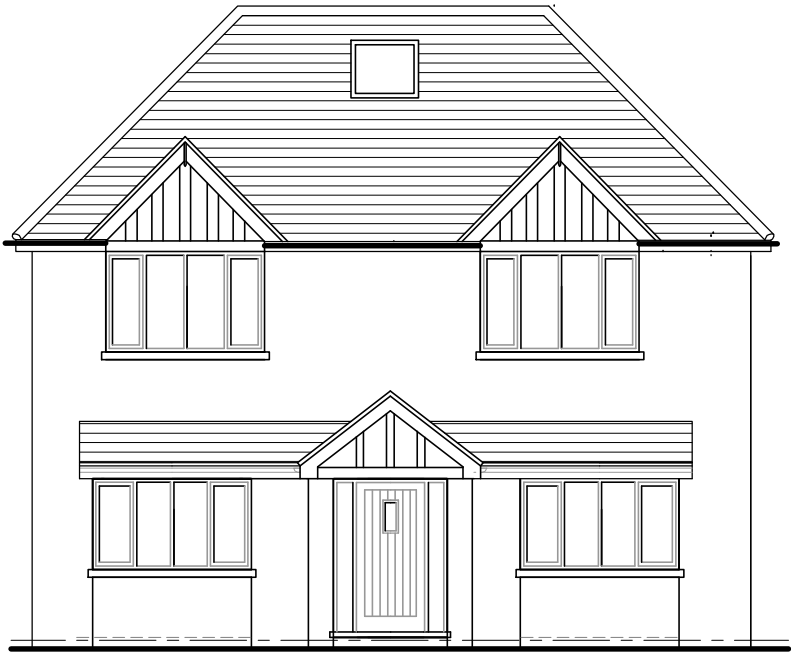
APPROVED FRONT ELEVATION 1:100