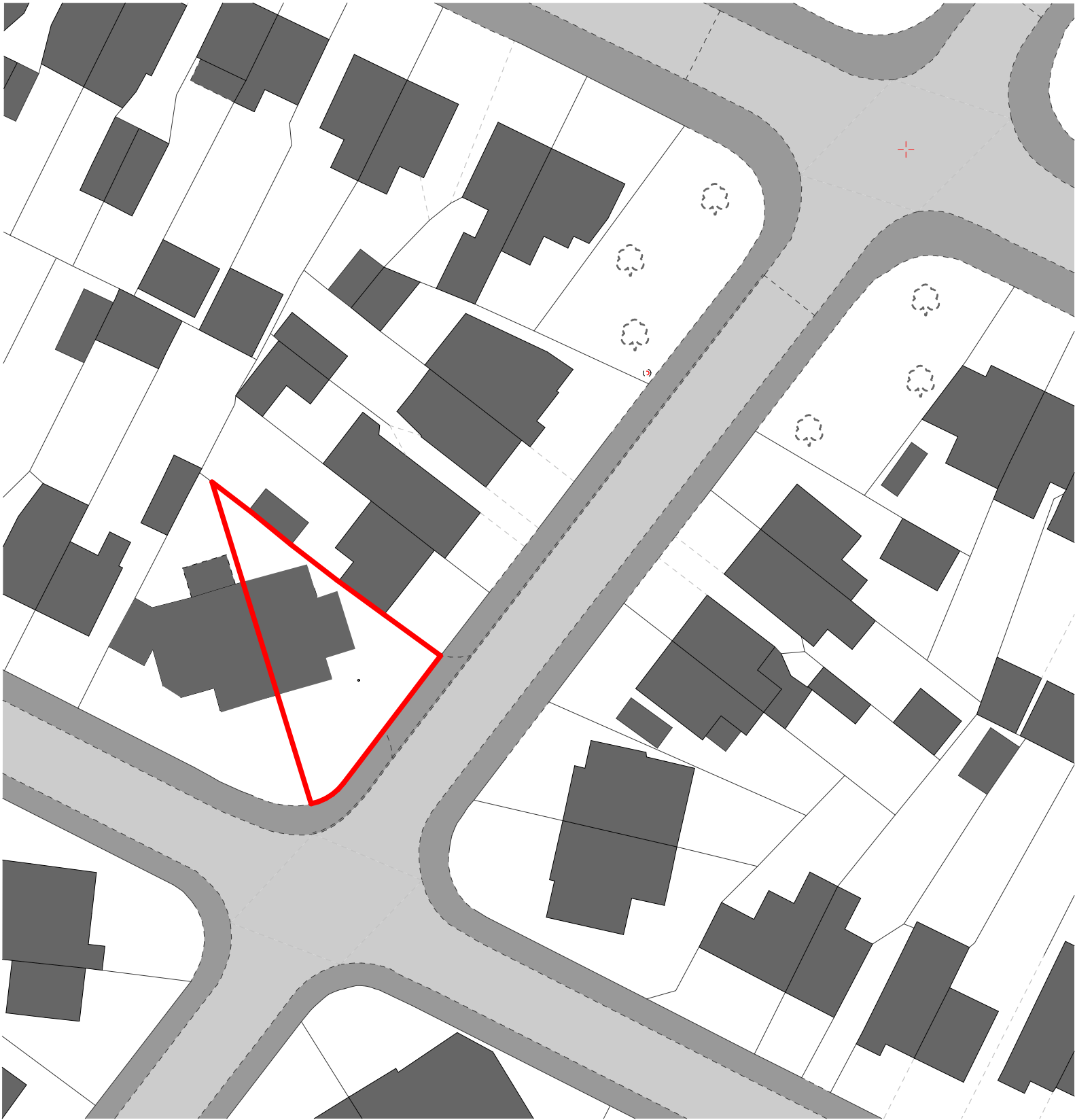
Proposed Block Plan - scale 1:500

©Copyright Prior to commencement of works on the site, the contractor should check all dimensions on the drawings and check against actual site dimensions, and report and discrepancies immediately to the Architect.