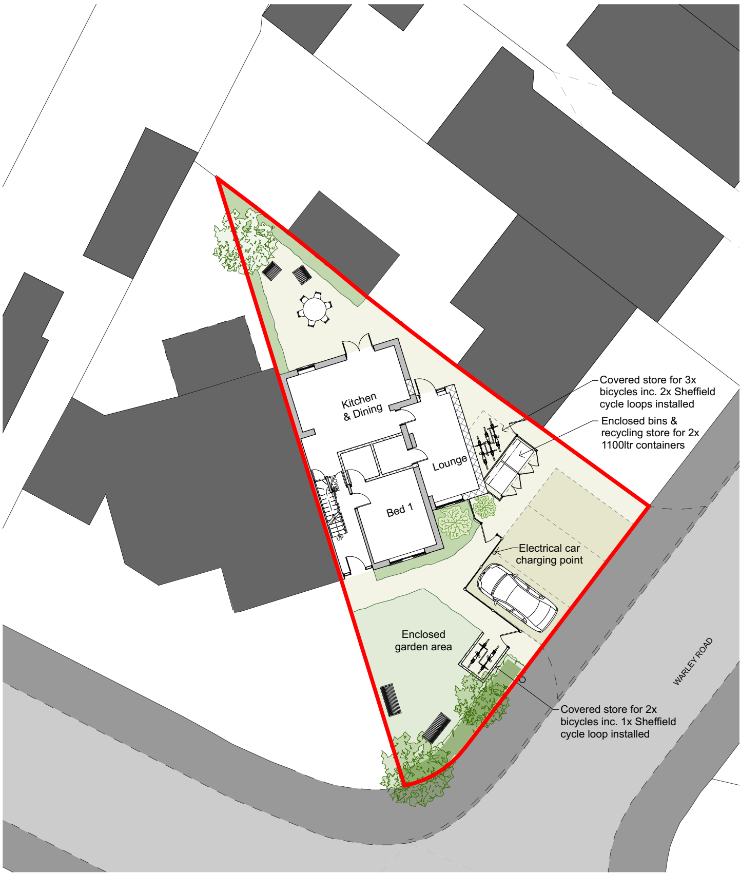
Proposed Site Plan - scale 1:200