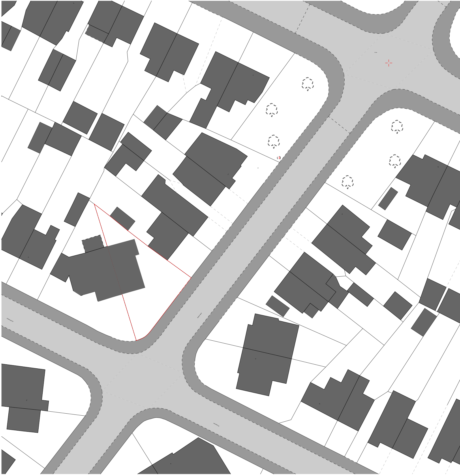
Existing Block Plan - scale 1:500

©Copyright Prior to commencement of works on the site, the contractor should check all dimensions on the drawings and check against actual site dimensions, and report and discrepancies immediately to the Architect.