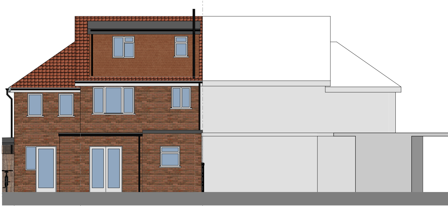
Proposed Rear Elevation - scale 1:100