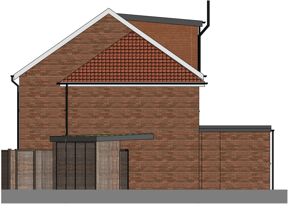
Proposed Side Elevation - scale 1:100

©Copyright Prior to commencement of works on the site, the contractor should check all dimensions on the drawings and check against actual site dimensions, and report and discrepancies immediately to the Architect.