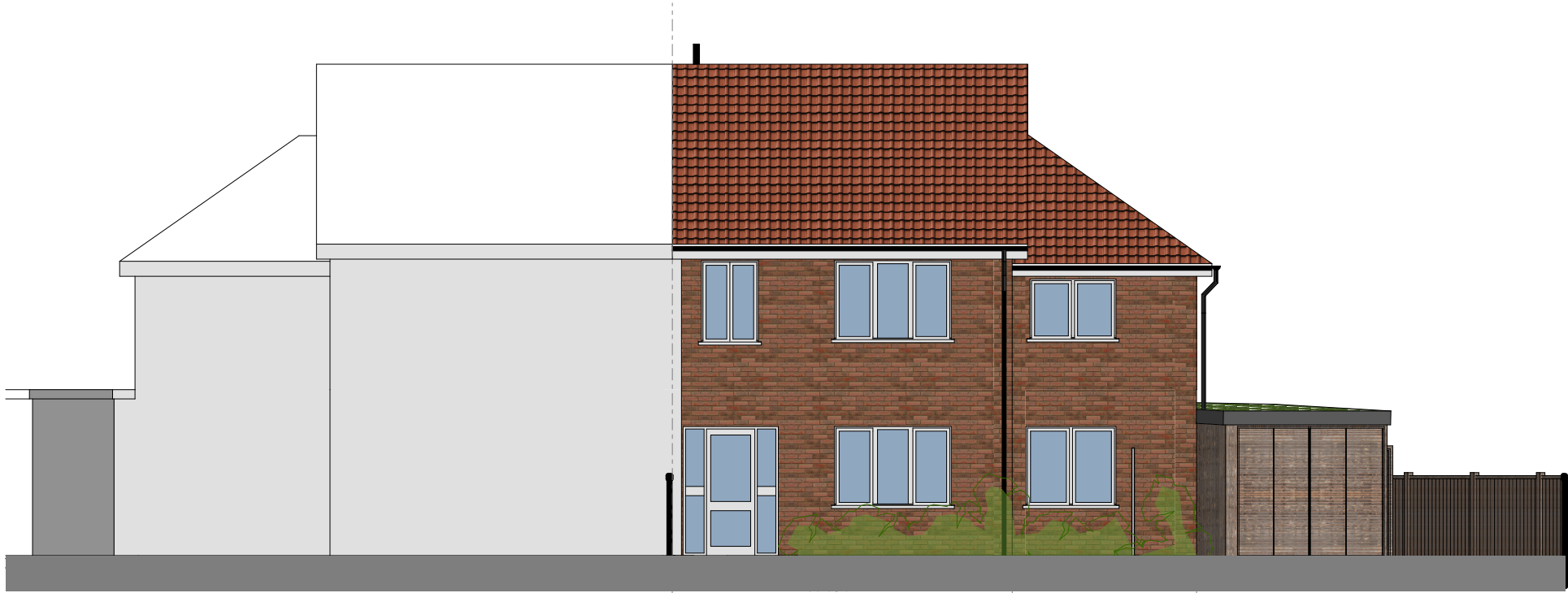
Proposed Front Elevation - scale 1:100