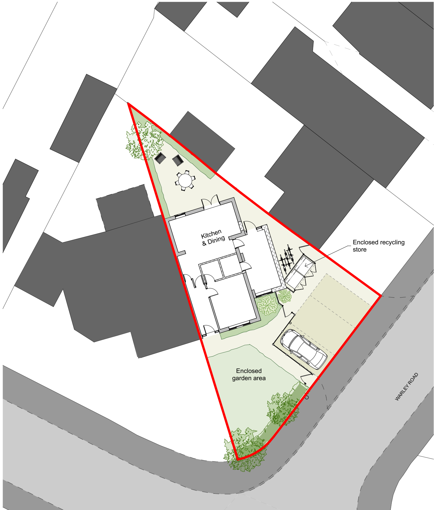
Proposed Site Plan - scale 1:200

©Copyright Prior to commencement of works on the site, the contractor should check all dimensions on the drawings and check against actual site dimensions, and report and discrepancies immediately to the Architect.