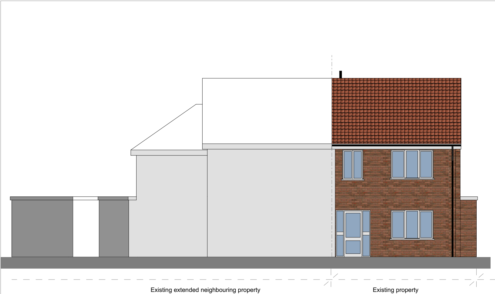
Existing Front Elevation - scale 1:100