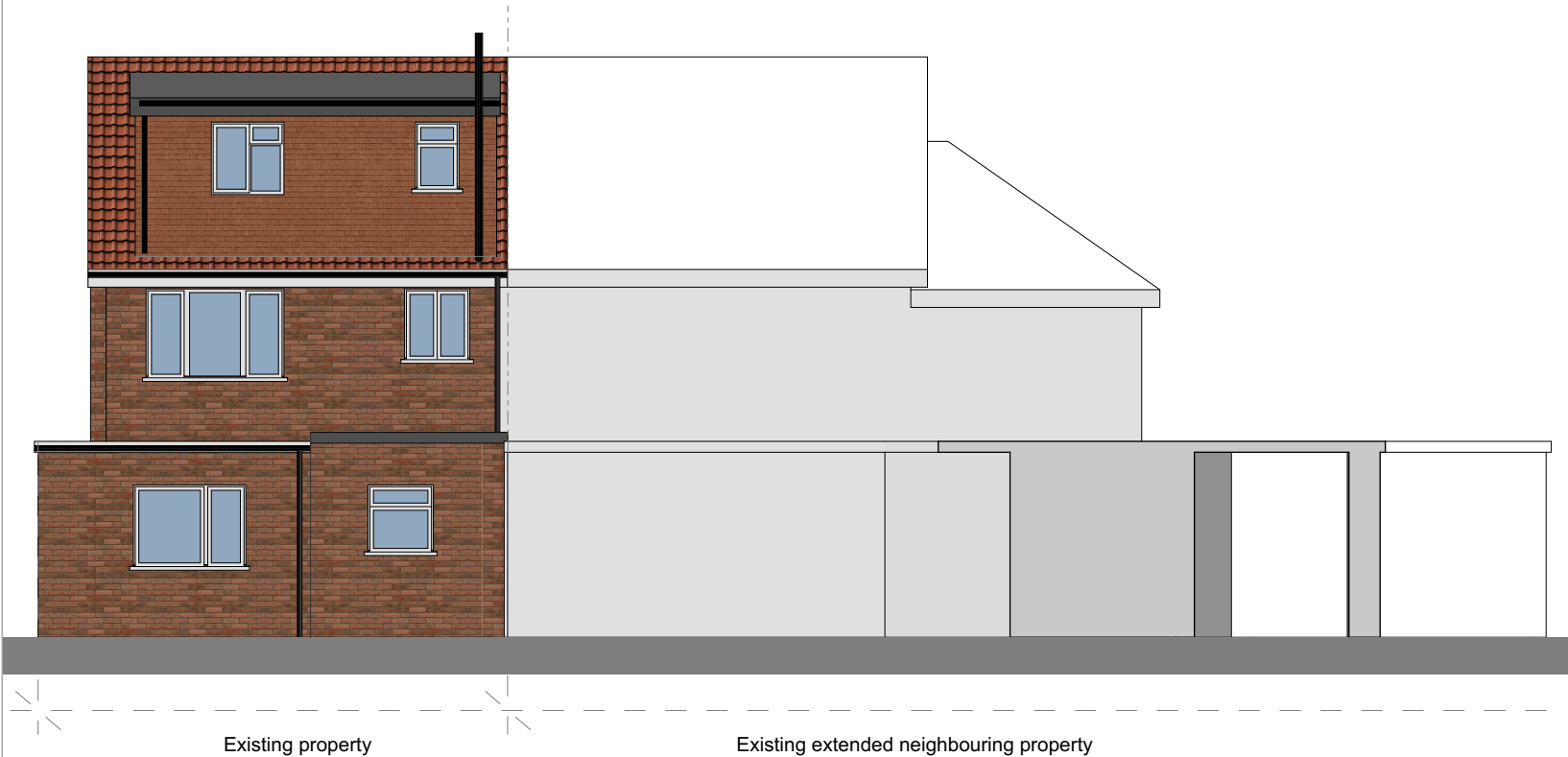
Existing Rear Elevation - scale 1:100