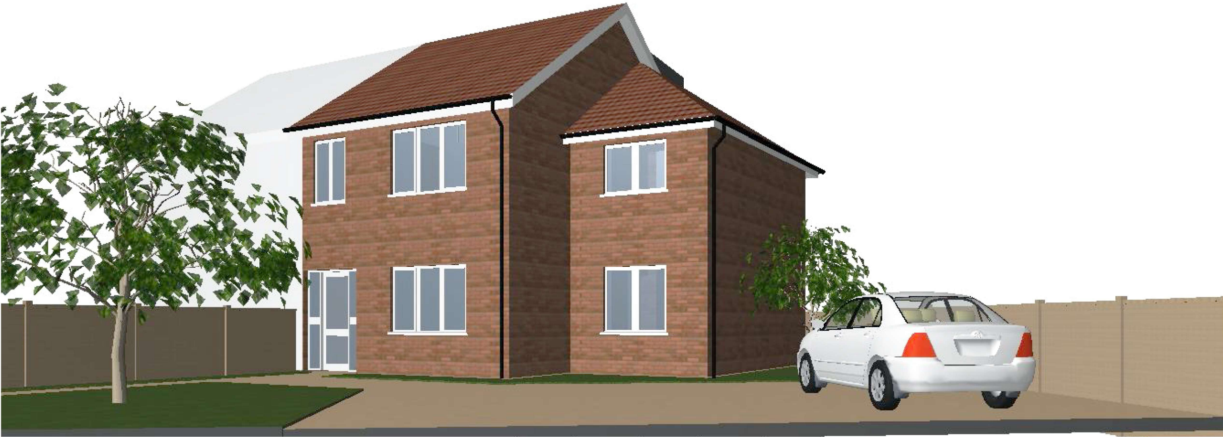
Proposed Rear Elevation - scale 1:100