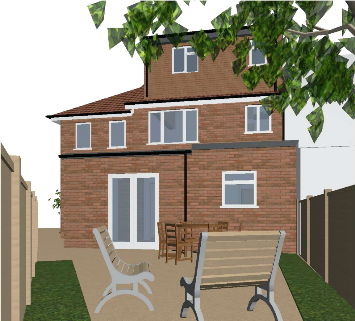
Proposed Rear Elevation - scale 1:100

©Copyright Prior to commencement of works on the site, the contractor should check all dimensions on the drawings and check against actual site dimensions, and report and discrepancies immediately to the Architect.