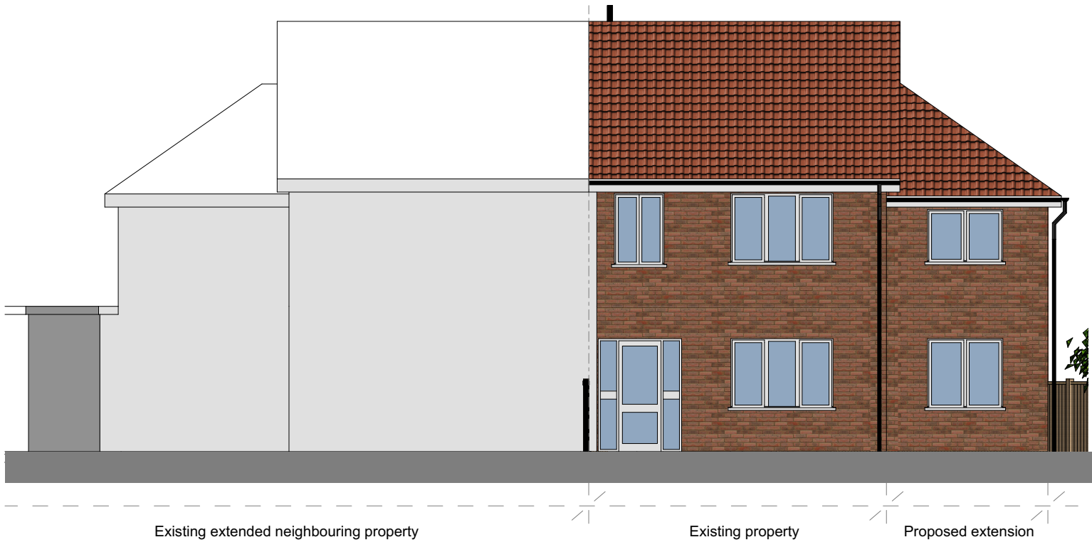
Proposed Front Elevation - scale 1:100