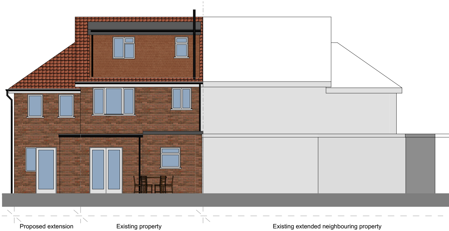
Proposed Rear Elevation - scale 1:100