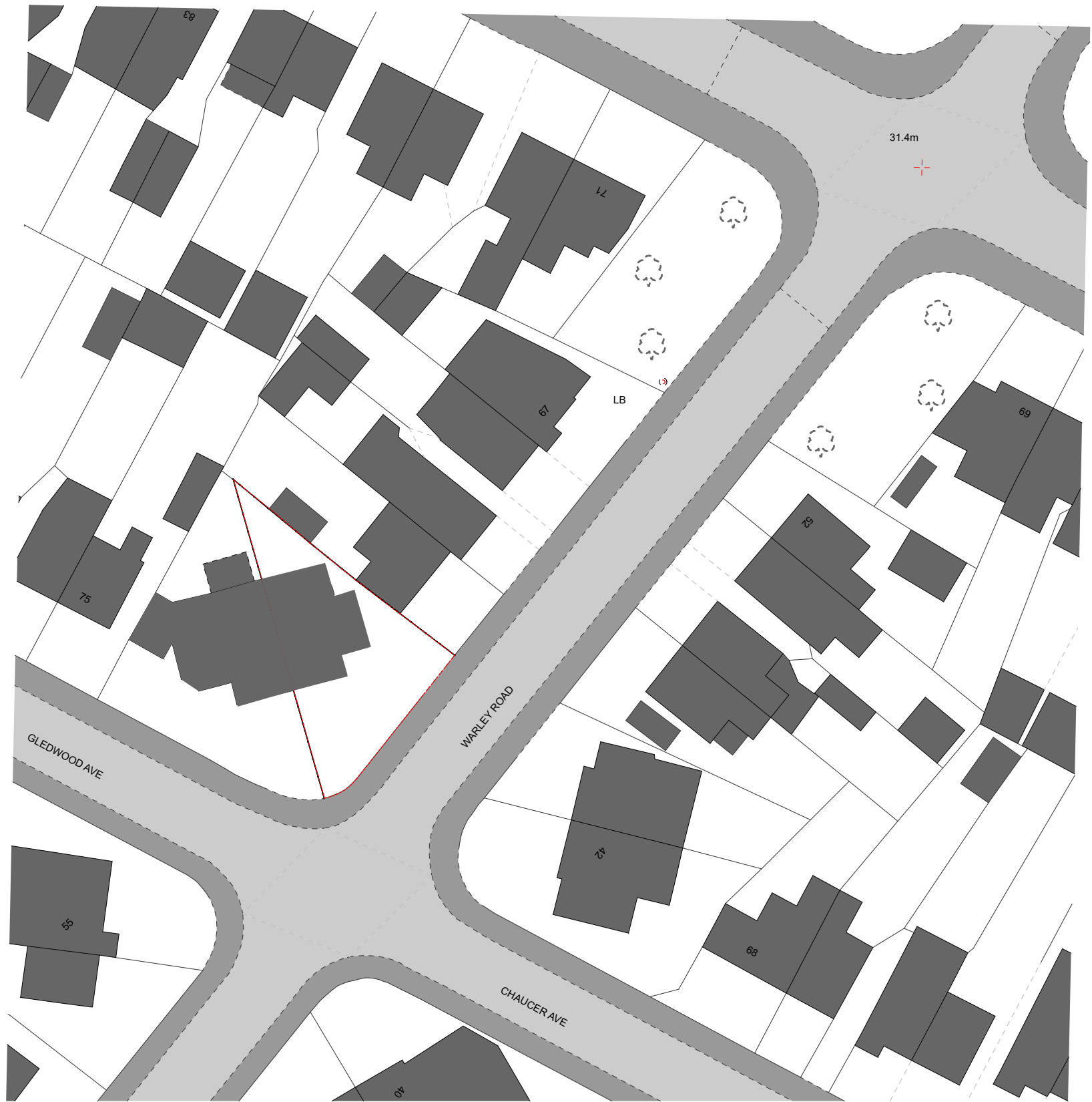
Proposed Block Plan - scale 1:500

©Copyright Prior to commencement of works on the site, the contractor should check all dimensions on the drawings and check against actual site dimensions, and report and discrepancies immediately to the Architect.