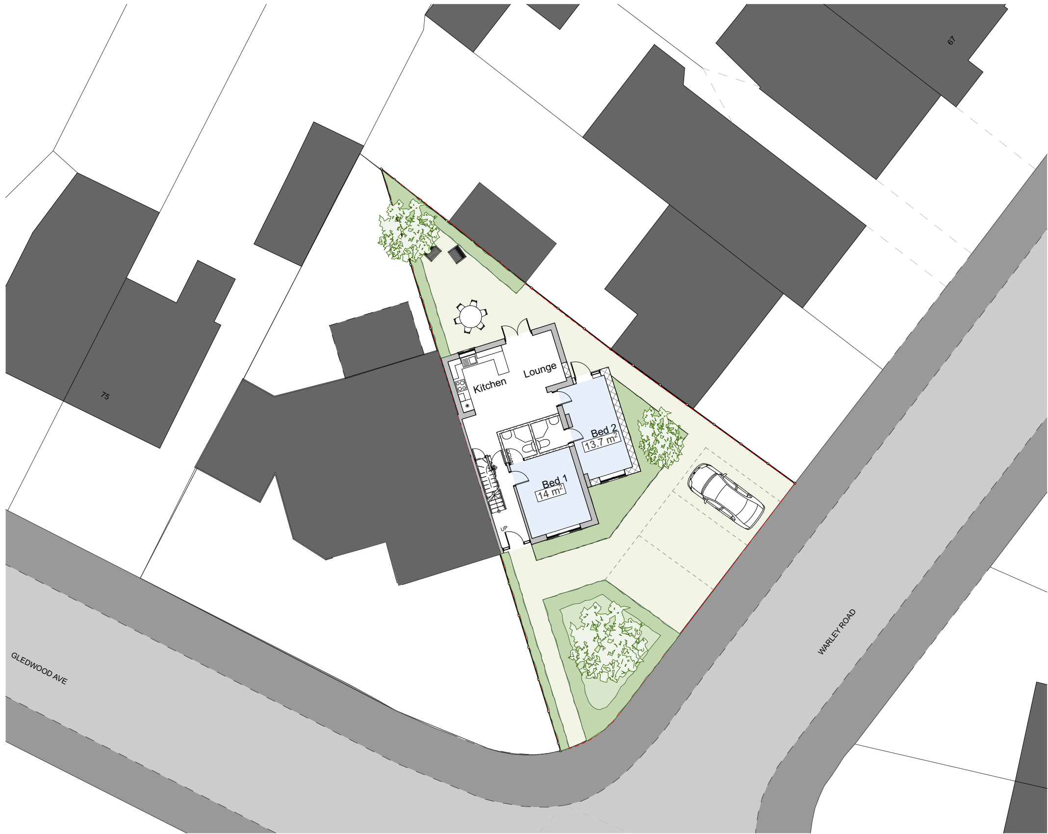
Proposed Site Plan - scale 1:200

©Copyright Prior to commencement of works on the site, the contractor should check all dimensions on the drawings and check against actual site dimensions, and report and discrepancies immediately to the Architect.