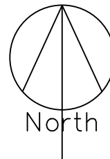
Location Plan 1 : 1 2 5 0