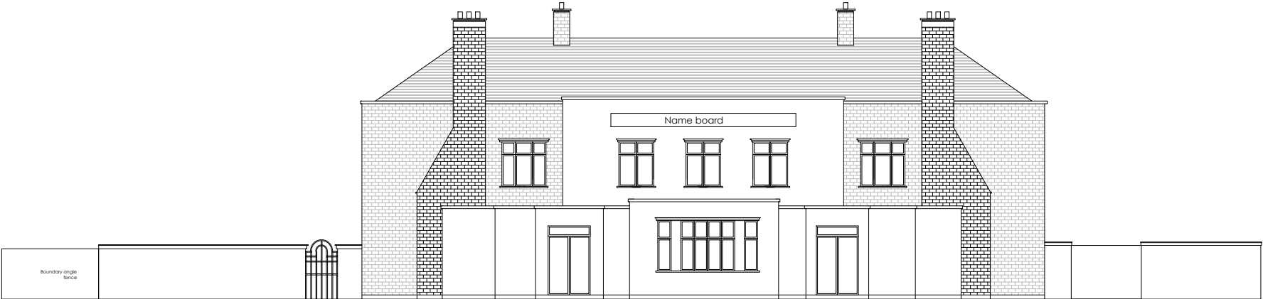
PRE-EXISTING FRONT ELEVATION

NOTES DO NOT SCALE. WORK TO FIGURED DIMENSIONS ONLY. CONTRACTOR TO CHECK ALL DIMENSIONS. ALL ERRORS AND OMISSIONS TO BE REPORTED TO THE ARCHITECT.