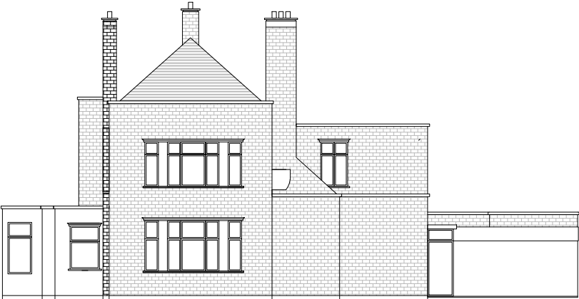
PRE-EXISTING SIDE ELEVATION