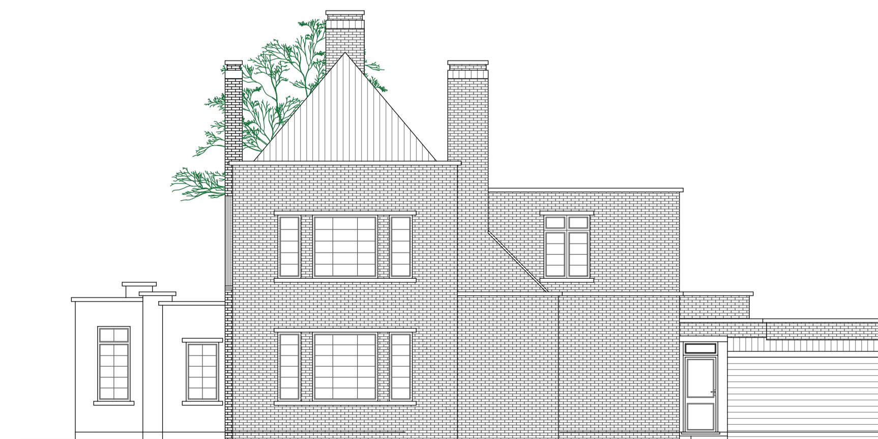
Existing Right Side Elevation