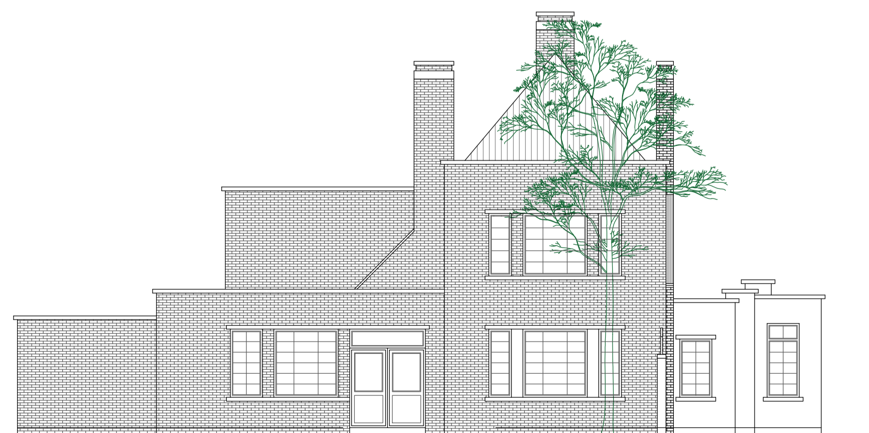
Existing Left Side Elevation