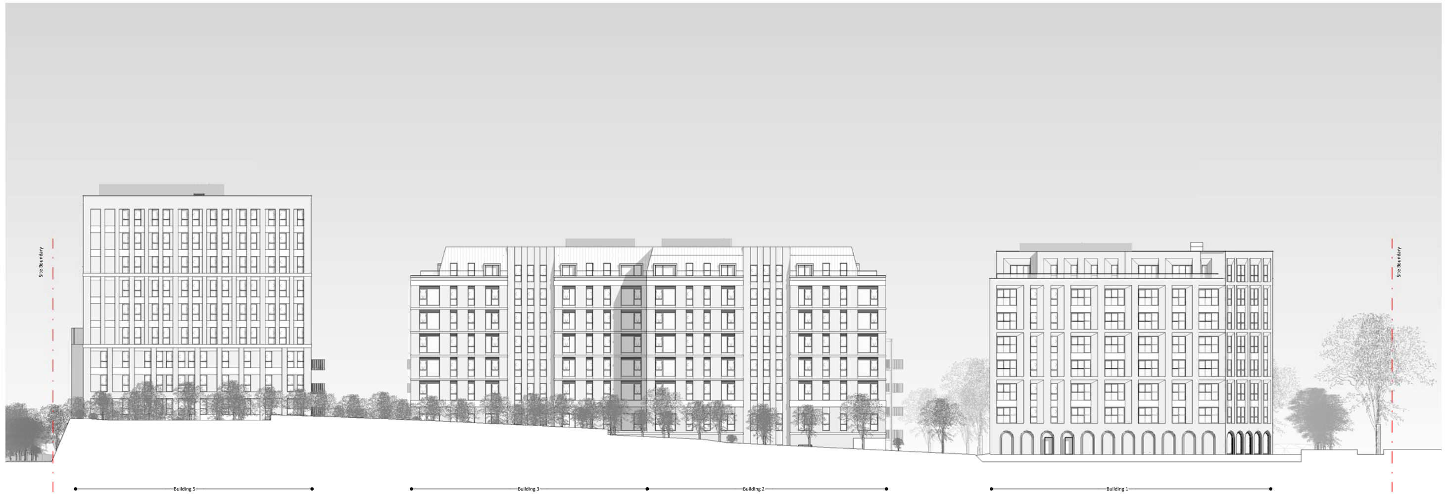
2 Site Elevation - West 1 : 250

NOTES CONSULTANTS - Refer to highways consultant's drawings for details - Refer to landscape consultant's drawings for details - Landscaping layout is indicative only AREAS - Refer to area schedule © Copyright Reserved. ColladoCollins Partners LLP