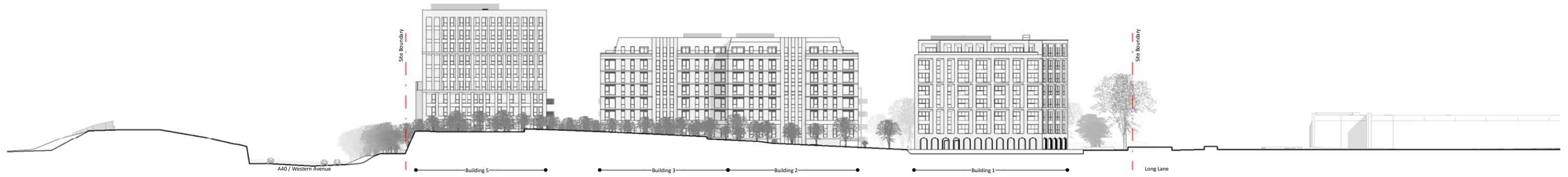
1 Site Elevation - West 1 : 500