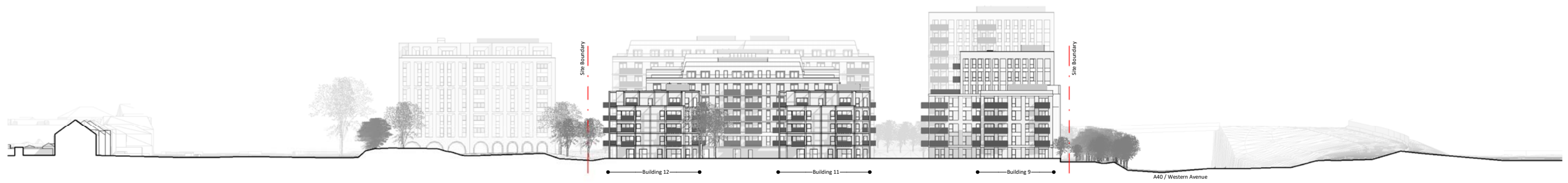
1 Site Elevation - East 1 : 500