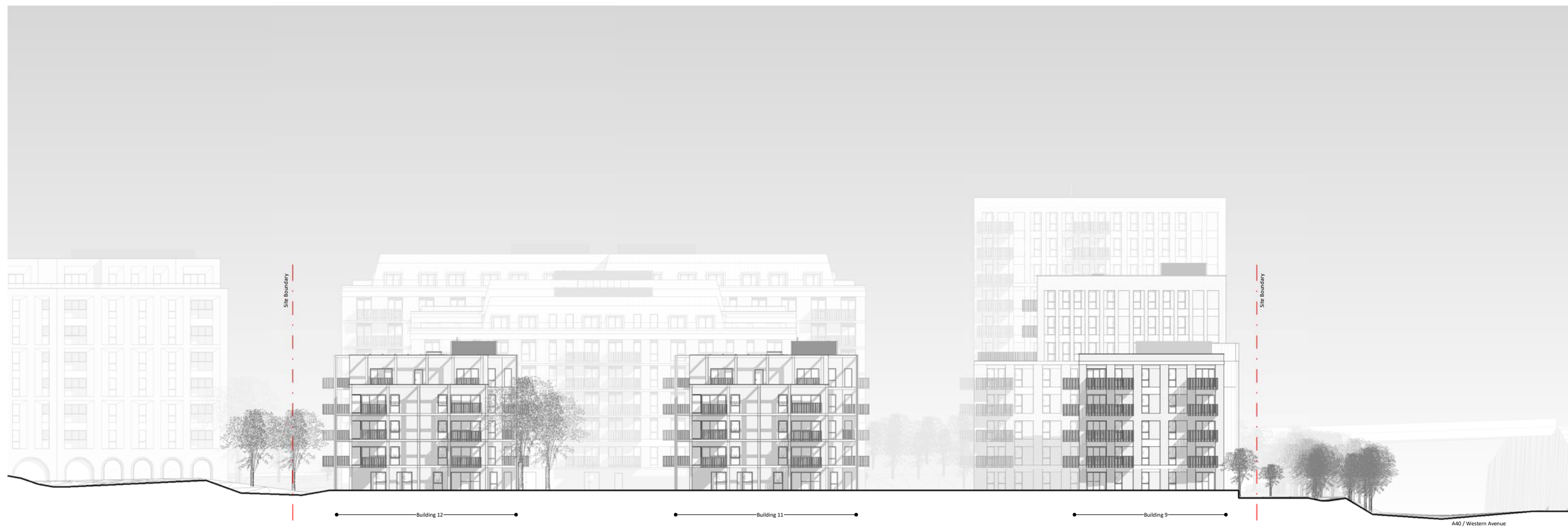
2 Site Elevation - East 1 : 250

NOTES CONSULTANTS - Refer to highways consultant's drawings for details - Refer to landscape consultant's drawings for details - Landscaping layout is indicative only AREAS - Refer to area schedule © Copyright Reserved. ColladoCollins Partners LLP