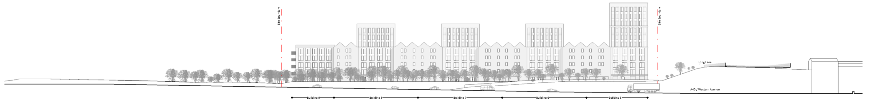
1 Site Elevation - North 1 : 500