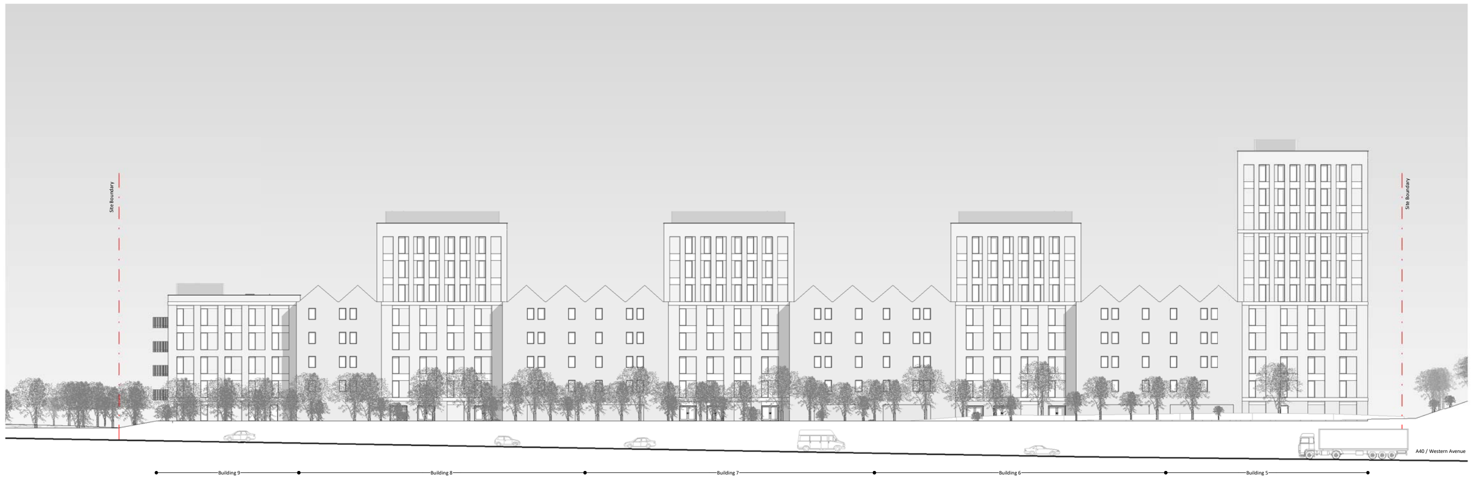
2 Site Elevation - North 1 : 250

NOTES CONSULTANTS - Refer to highways consultant's drawings for details - Refer to landscape consultant's drawings for details - Landscaping layout is indicative only AREAS - Refer to area schedule © Copyright Reserved. ColladoCollins Partners LLP