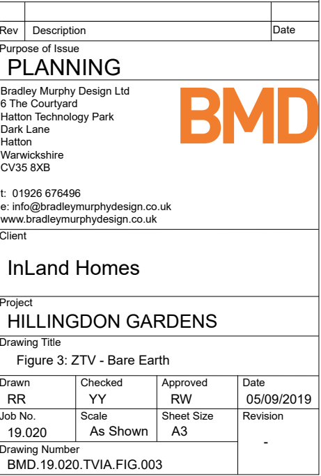
Figure 3 : Zone of Theoretical Visibility Bare Earth, represents the worst case scenario. This treats landform as if it were 'bare earth' and illustrates the area within which the development would theoretically be visible assuming other vertical features within the landscape and built environment (such as buildings, infrastructure and vegetation) would not act as barriers to views toward the development.