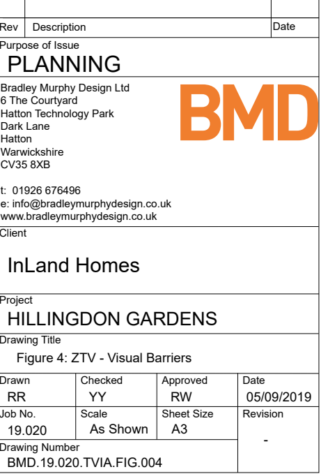
Figure 4: Zone of Theoretical Visibility Visual Barriers, takes account of the effect that settlements and significant woodland blocks / belts would have on views toward the proposed development and therefore illustrates a more realistic area within which the development could theoretically be visible.