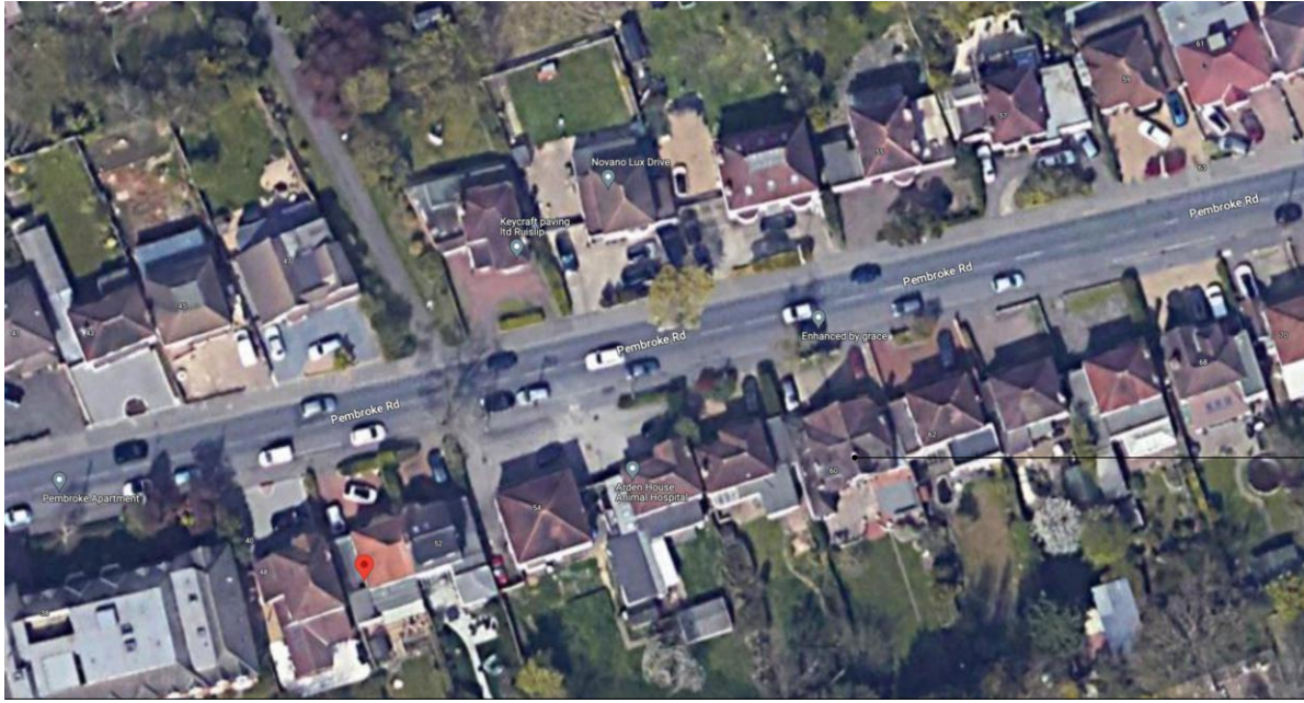
Application site: 60 Pembroke Road