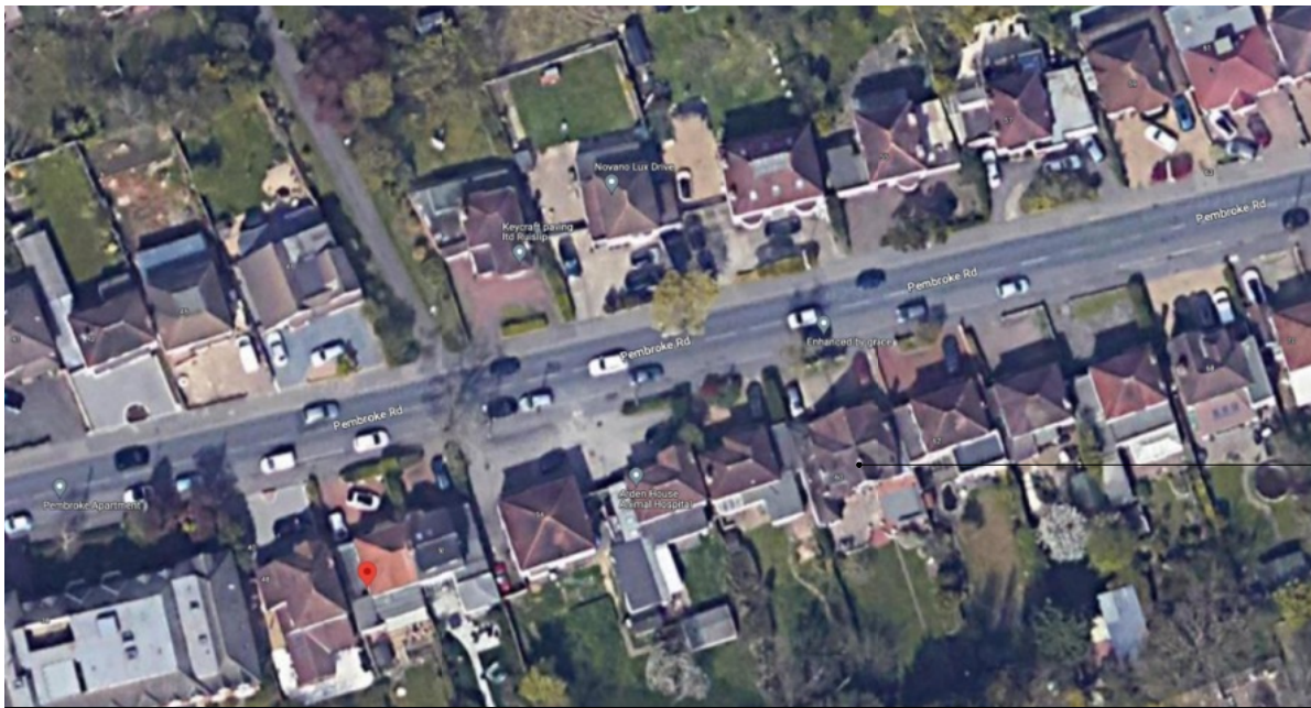
Application site: 60 Pembroke Road