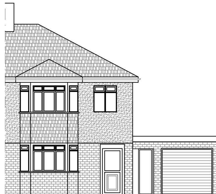
PRE EXISTING FRONT ELEVATION