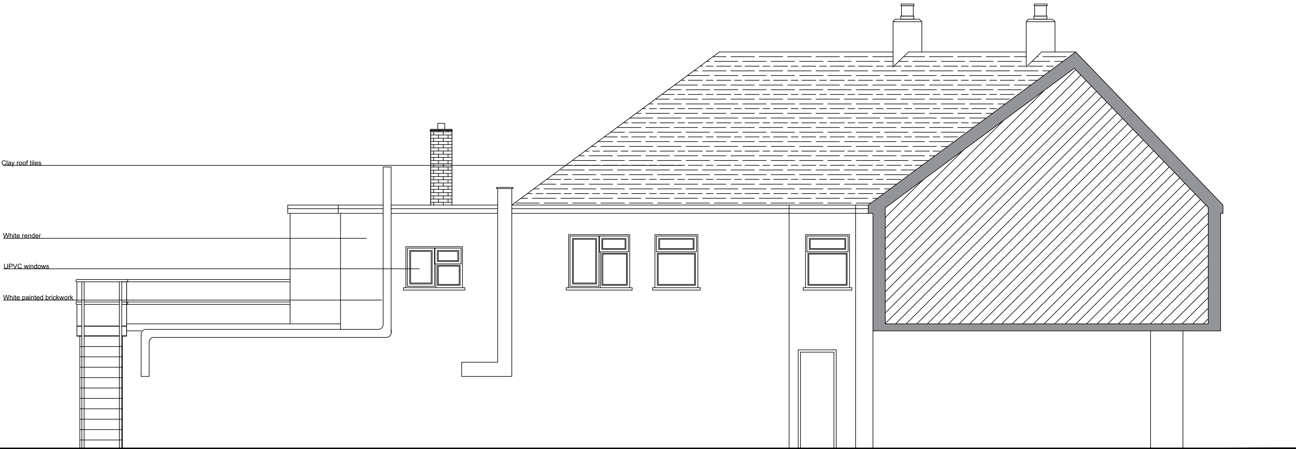
ELEVATION B EXISTING SIDE ELEVATION

Written dimensions to be taken in preference to scaled dimensions.