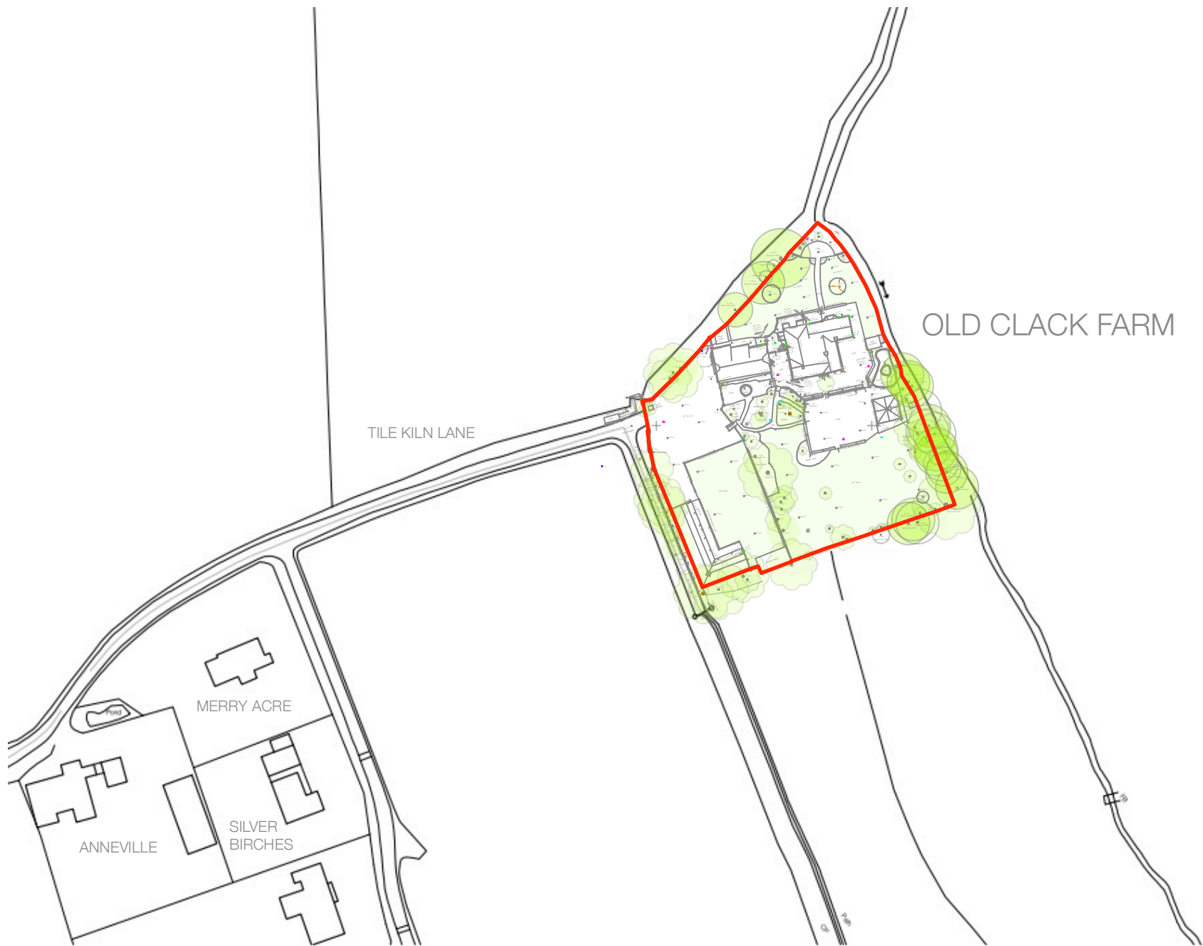
Existing Site Location Plan Scale 1:1250