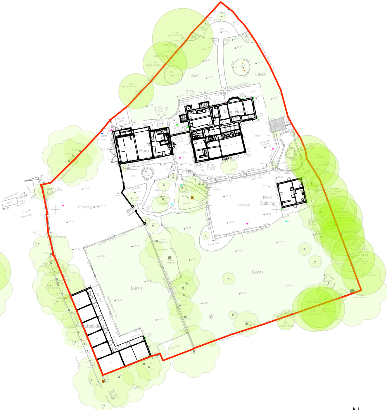
Existing Site Plan Scale 1:500