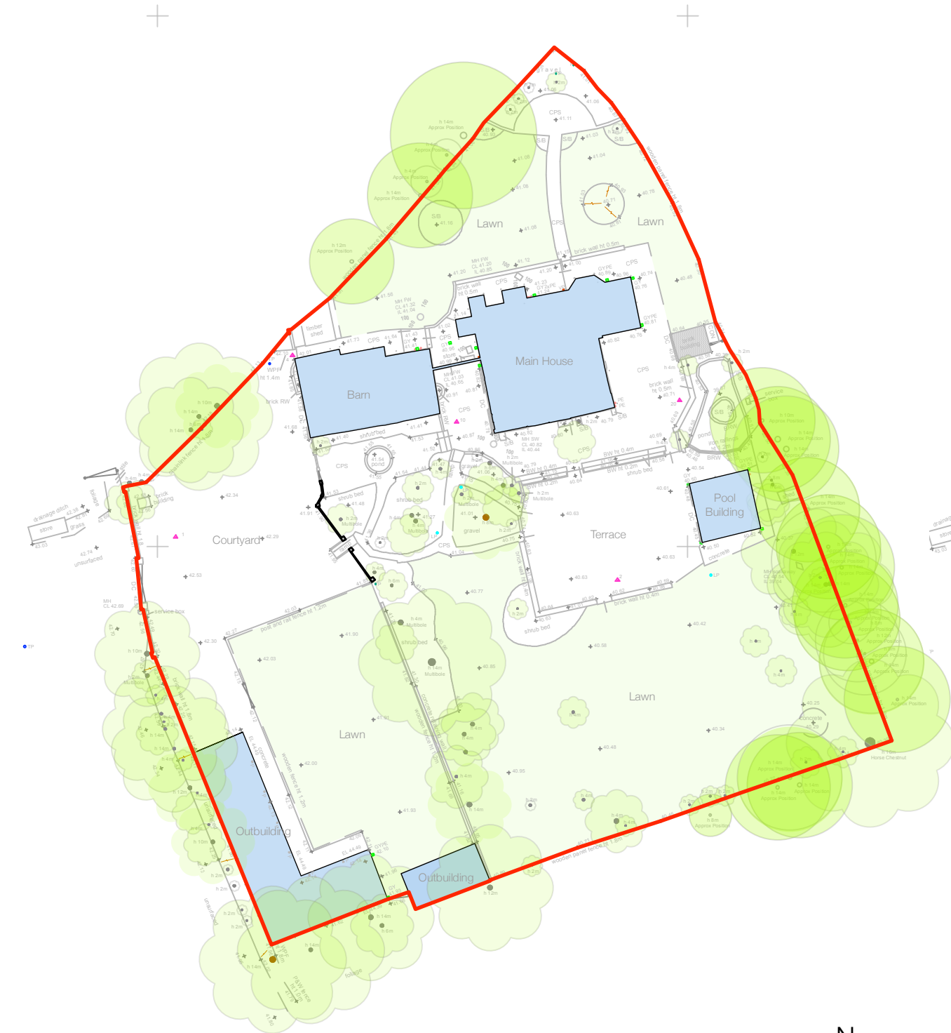
Existing Block Plan Scale 1:500

www.kristianpeelarchitecture.co.uk studio@kristianpeelarchitecture.co.uk