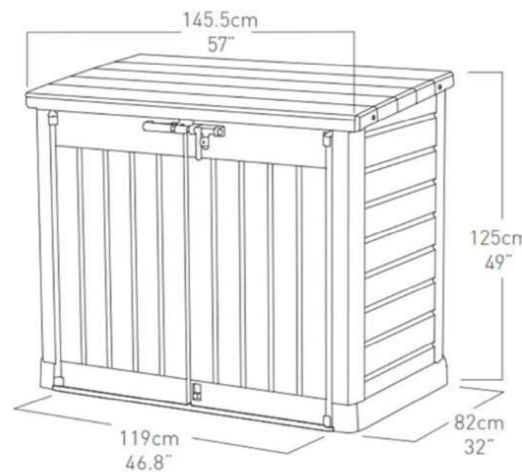
Bin Store - Not to Scale (Dimensions Included)