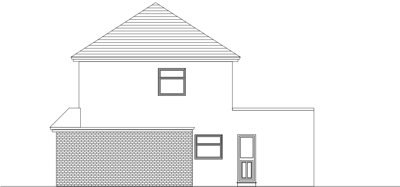
EXISTING SIDE ELEVATION PLAN