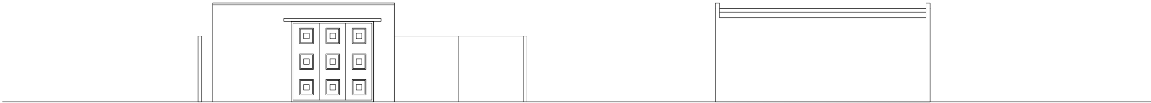
EXISTING ELEVATION C