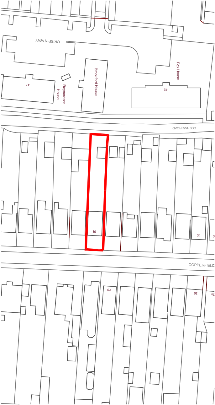
Location Plan - 1:1250