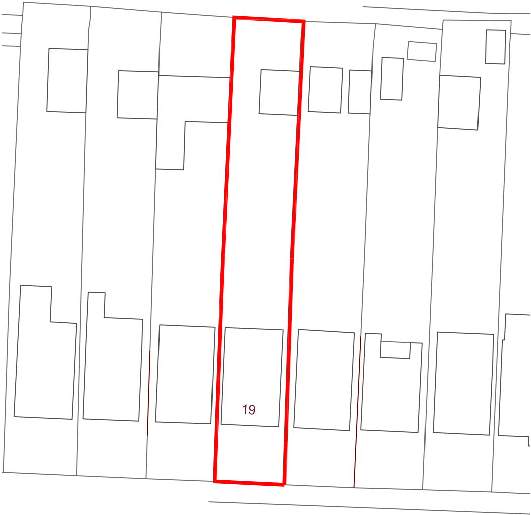
Block Plan - 1:500