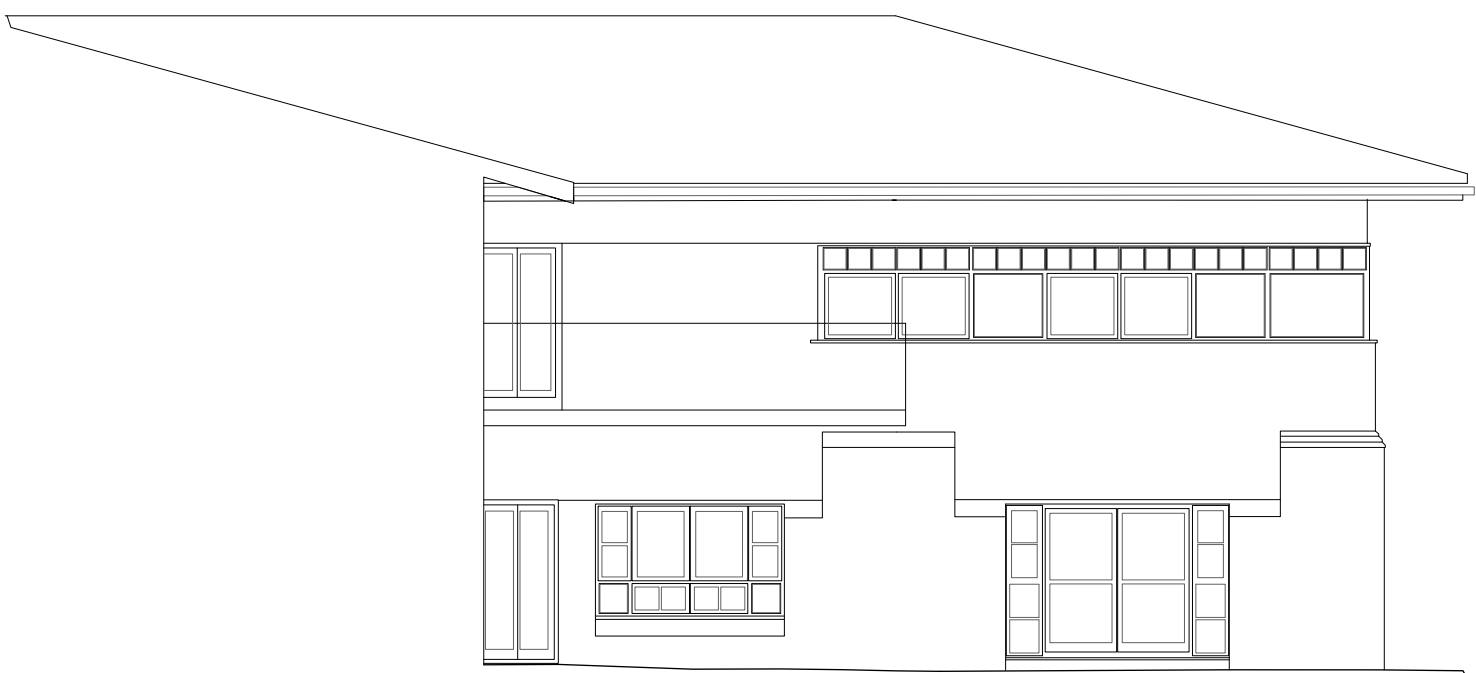
7 Existing and Proposed Elevation 07 Scale: 1:100