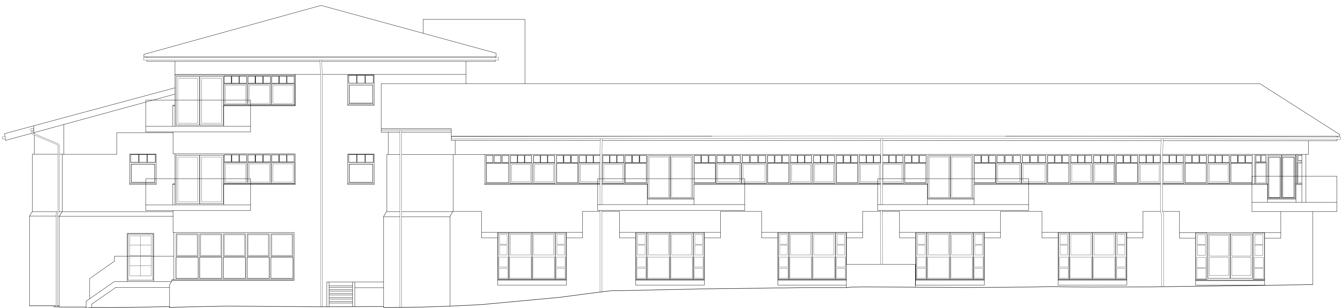
5 Existing and Proposed Elevation 05 Scale: 1:100