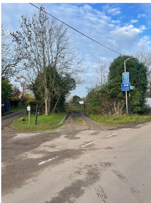
View into track from Springwell Lane

Notes This document and its design content is copyright ©. It shall be read in conjunction with all other associated project information including models, specifications, schedules and related consultants documents. Do not scale from documents. All dimensions to be checked on site. Immediately report any discrepancies, errors or omissions on this document to the Originator. If in doubt ASK. ####