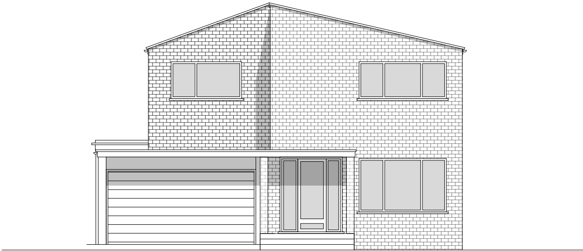
Proposed front elevation scale 1:100