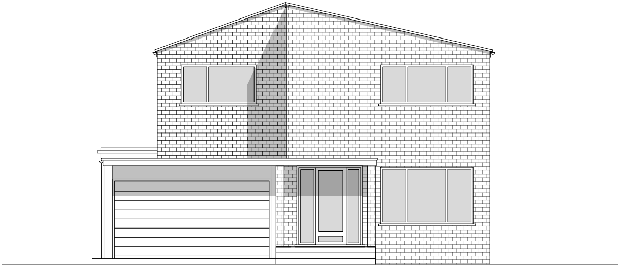
Existing front elevation scale 1:100