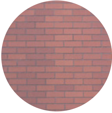
3 Wall/ Boundary- Brick Ketley Staffordshire Red