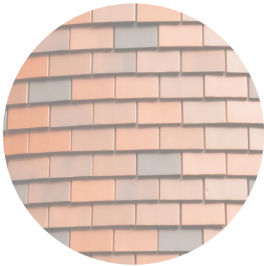
1 Roof- Clay tiles Dreadnought country/brown brindle