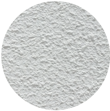
2 Walls- Render Lime harling roughcast