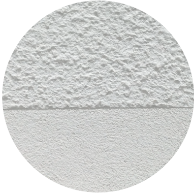
2 Walls- Render Lime harling roughcast