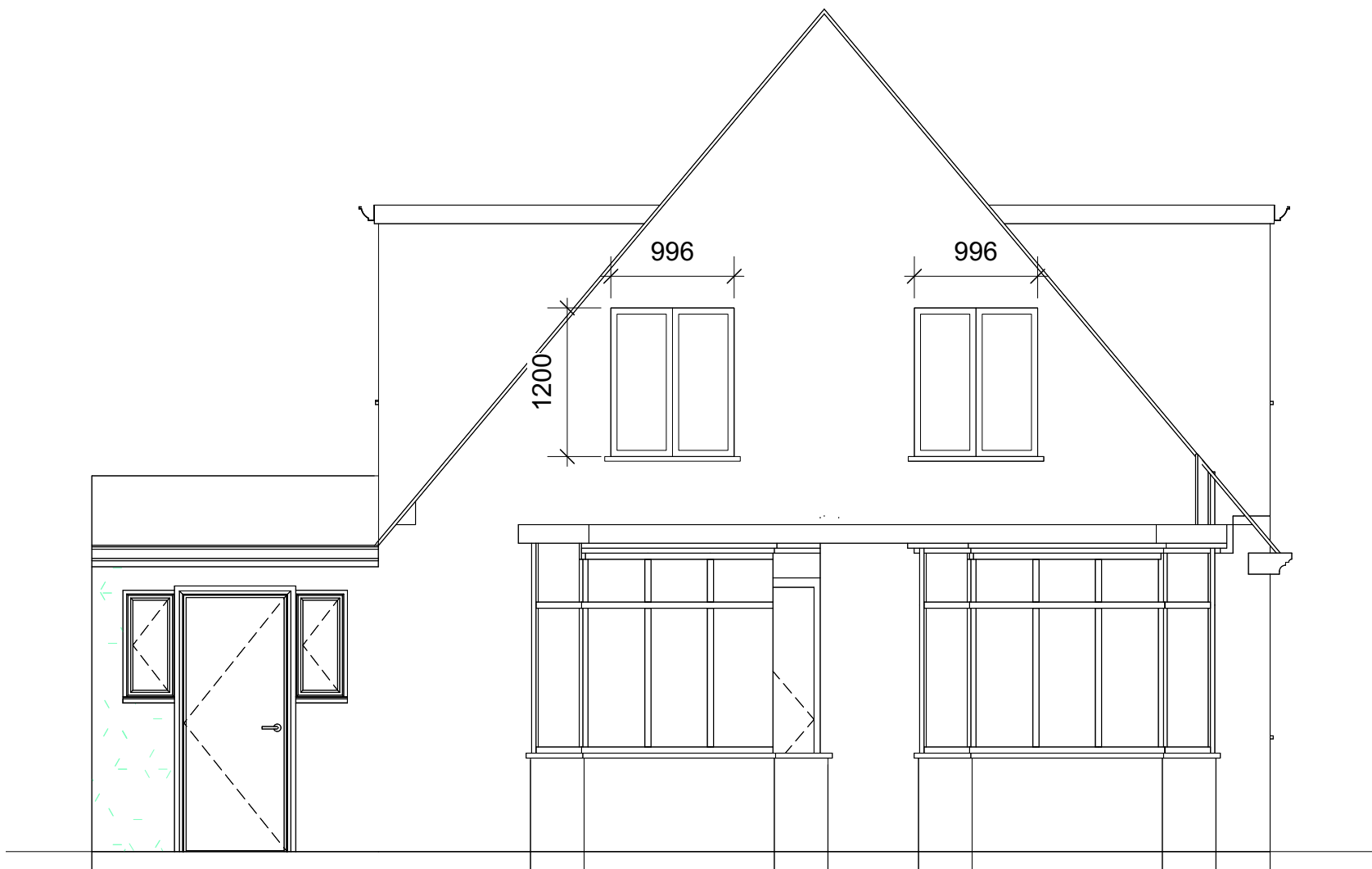
1 PROPOSED Front Elevation Scale: 1:50