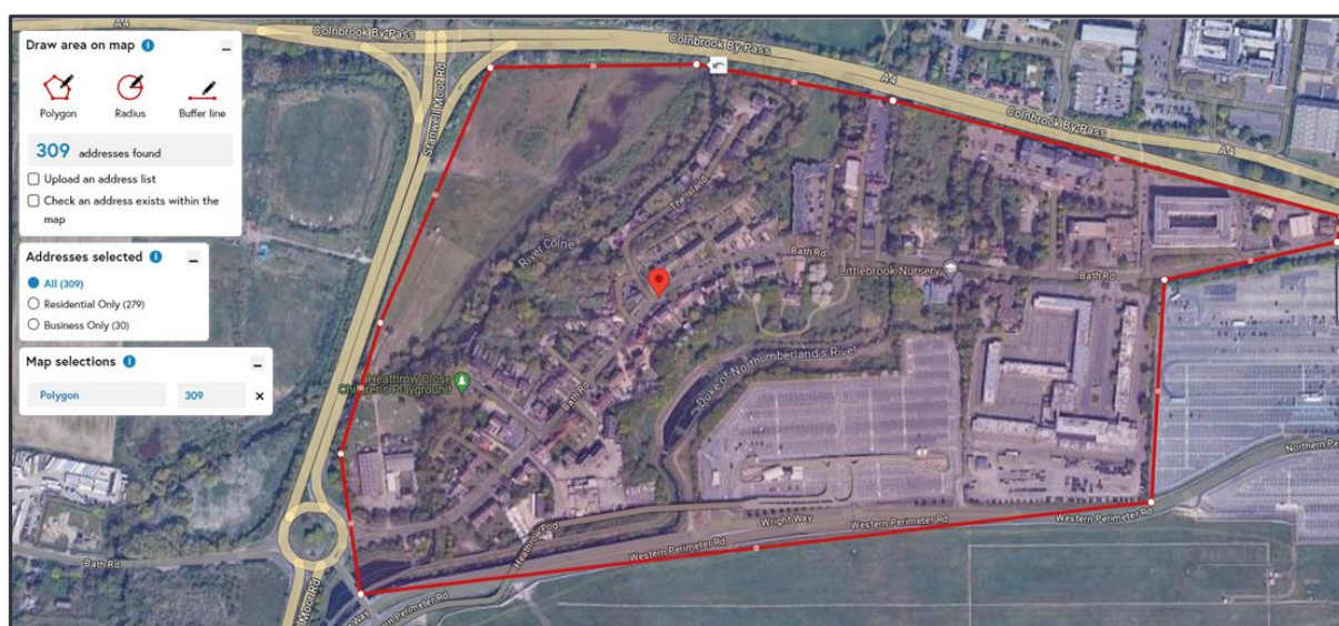
Graphic 5.1.1 Addresses selected for feedback