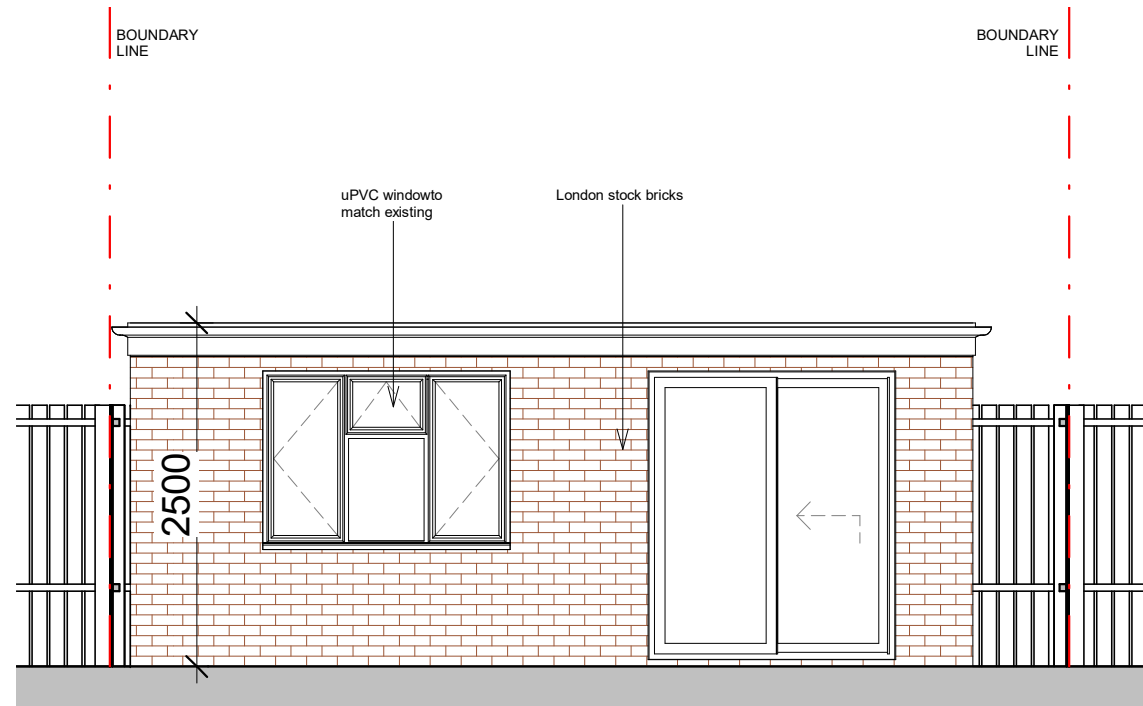
PP-PROPOSED FRONT ELEVATION 1 : 50